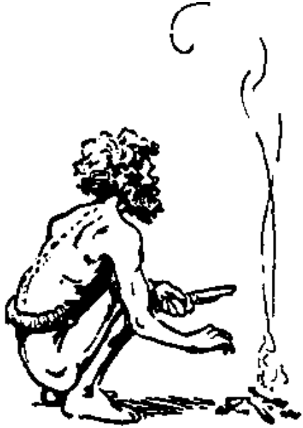
The natives of Australia often used signal fires to send messages.